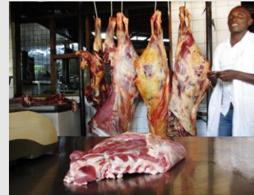
Jacob's fresh meat *****