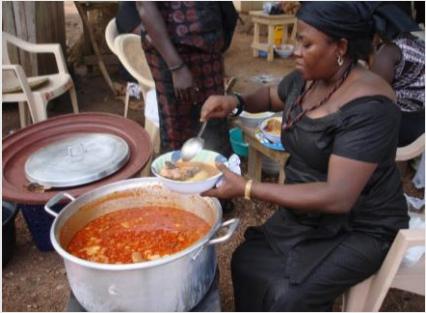
Grace's goat stew *****