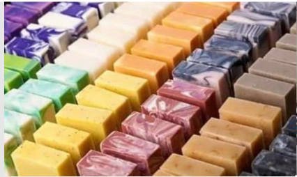
Daisy's Soaps ***